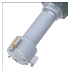
TiN coated contact points (" -10" suffix models only)